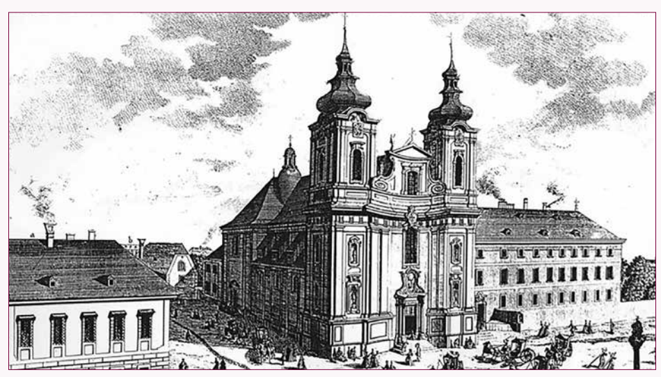
Holy Trinity Church, Vienna